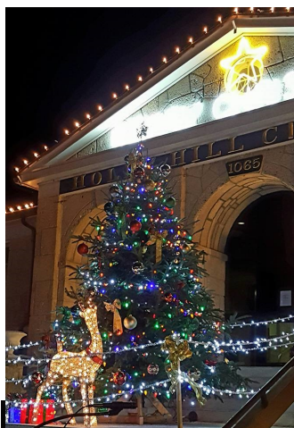
Left: The City of Holly Hill introduced its new lawn decorations during the tree lighting ceremony.

Right: The 57th Holly Hill Christmas Parade was enjoyed by the crowd lining Ridgewood Avenue.