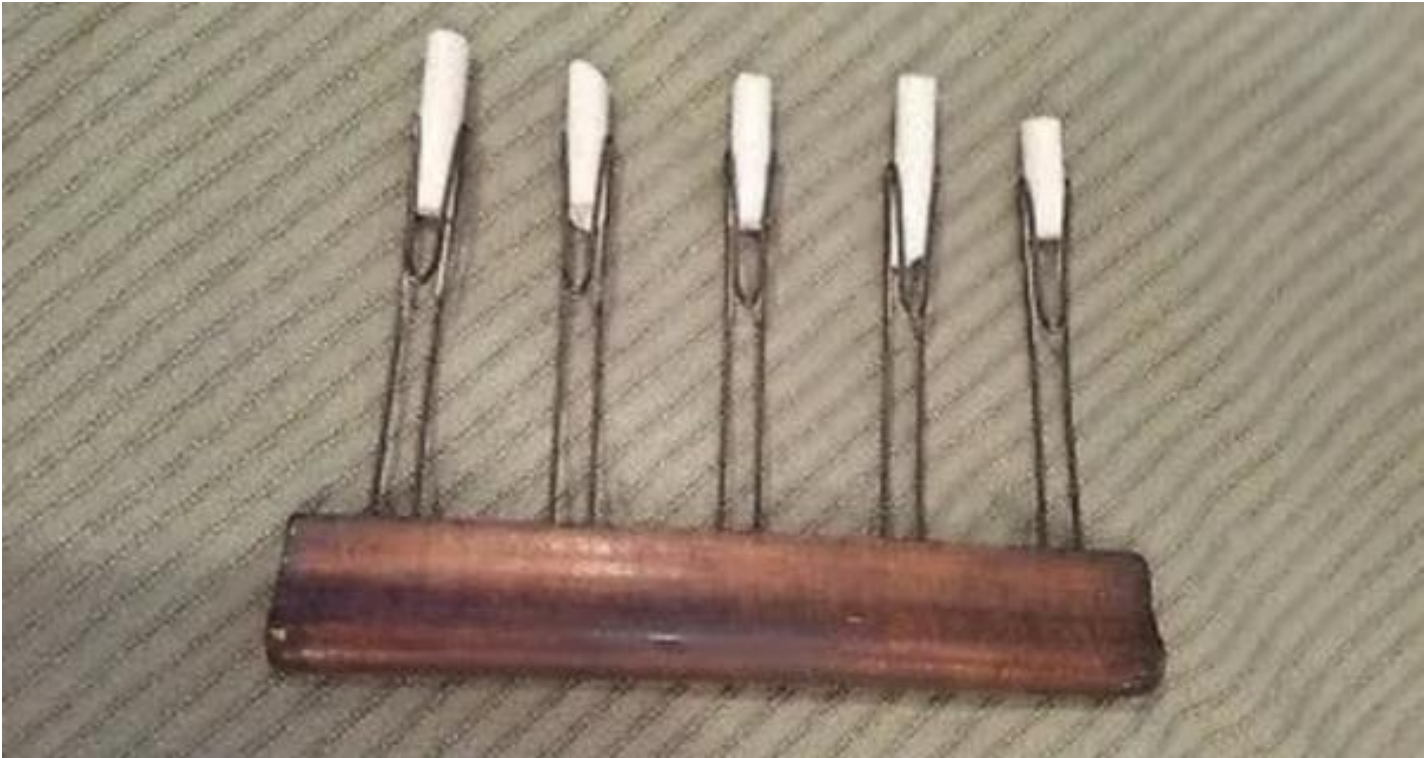
. If you ever had to use this in a classroom...