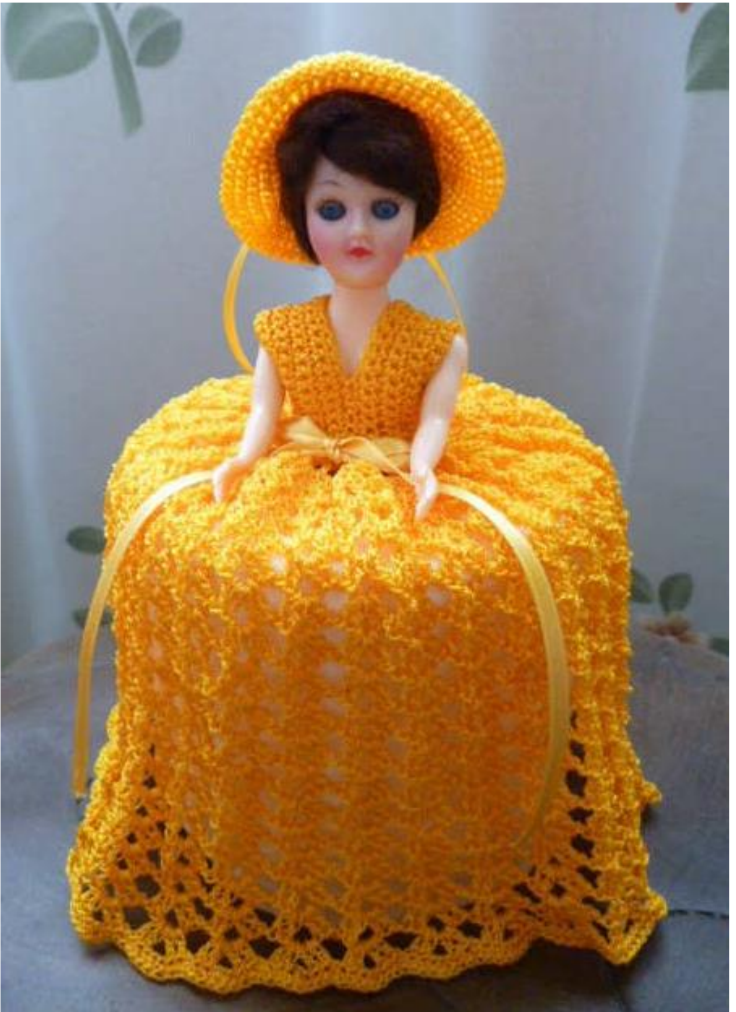
If you know what's under this doll...