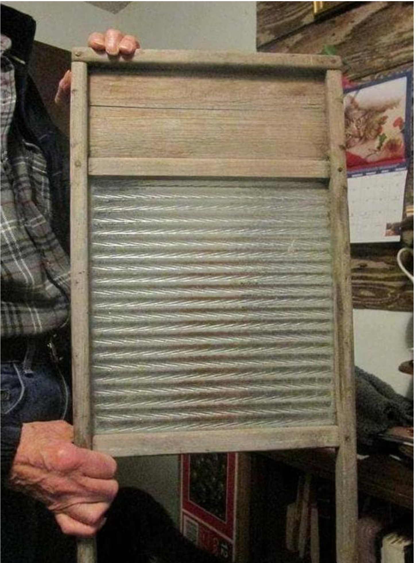
If you know what this is used for...