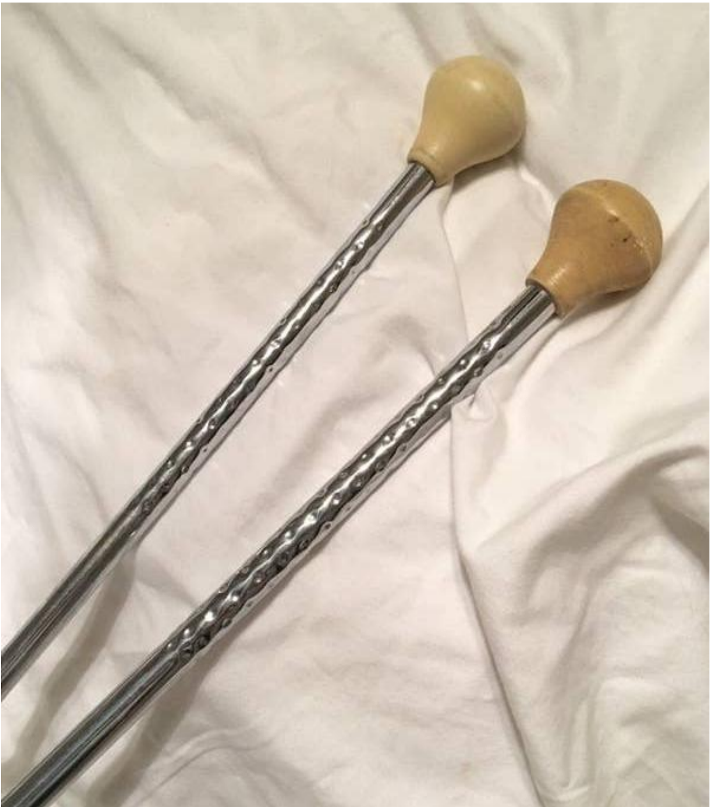
If you've ever performed with these...