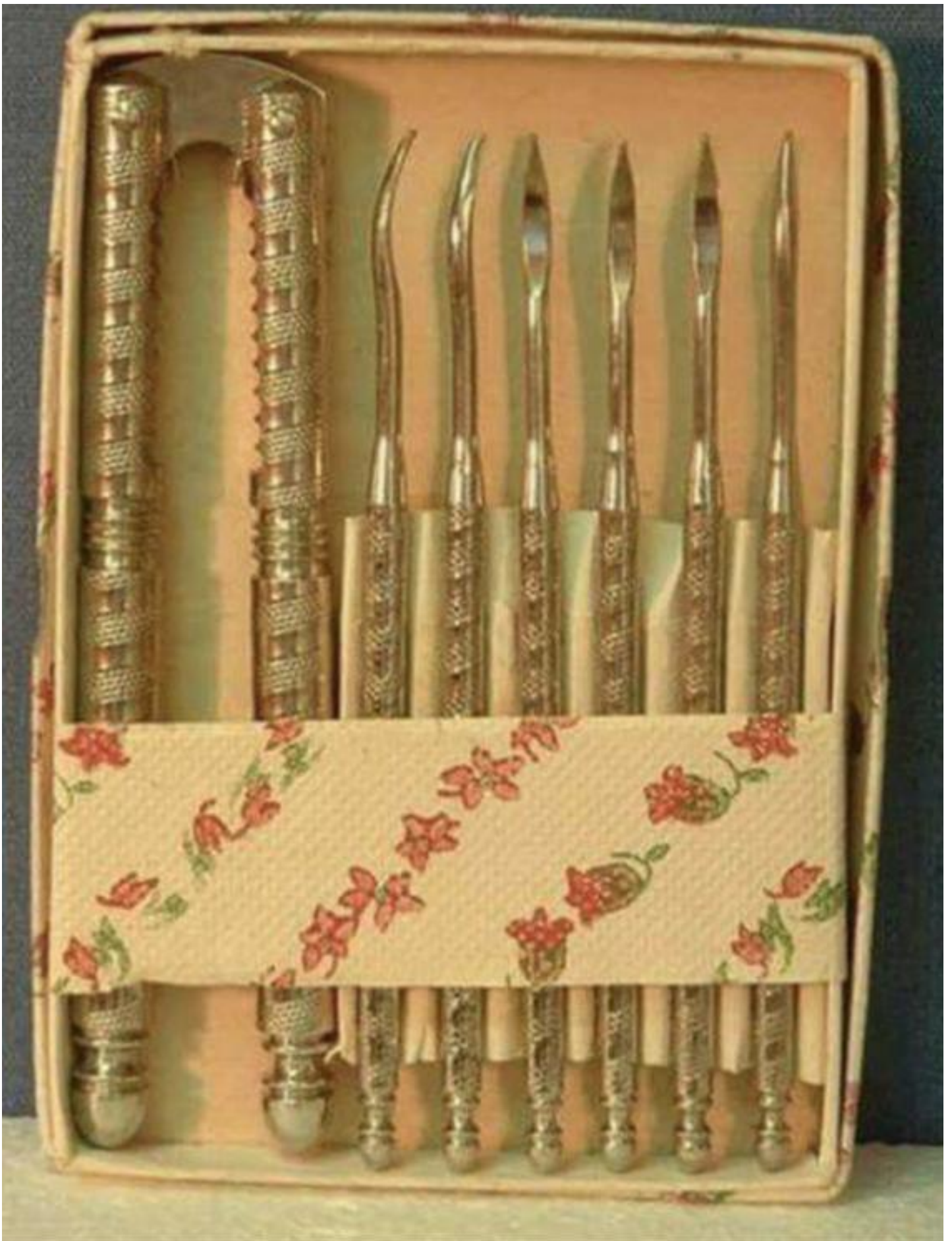
If you know full well that these are not medieval torture devices...