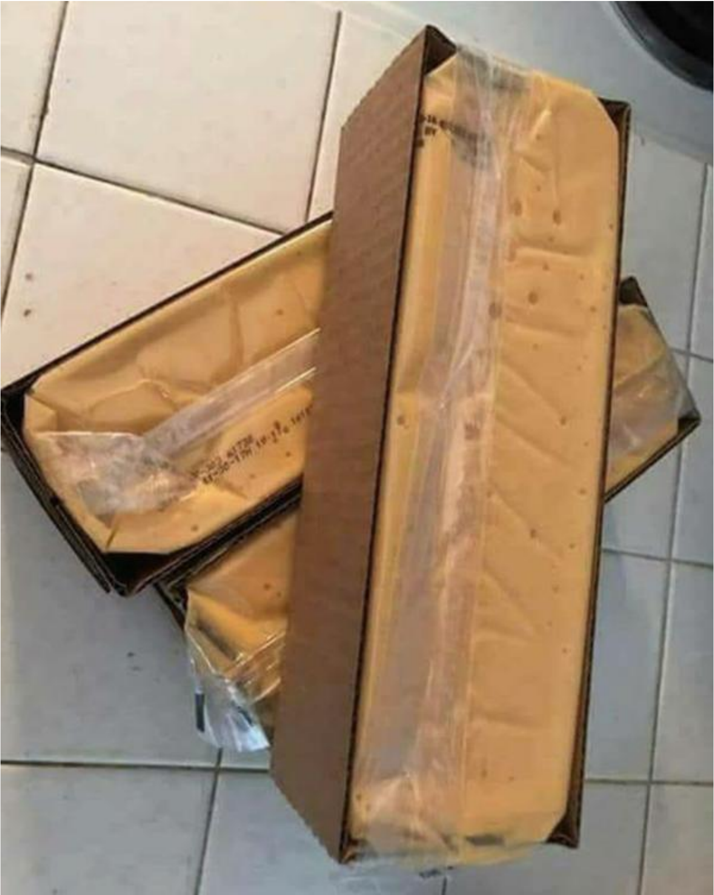
If you know what's in this box and have eaten it...