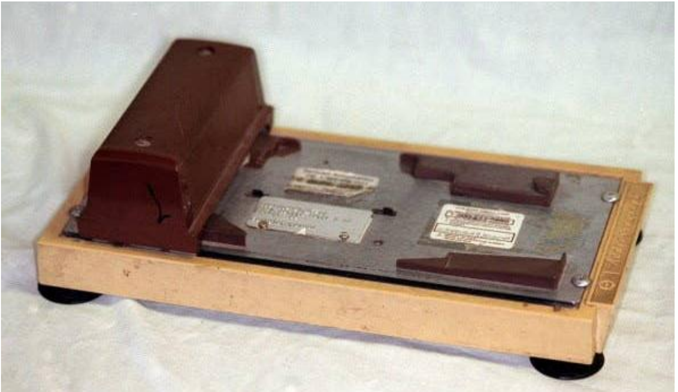
If you know what this is used for...