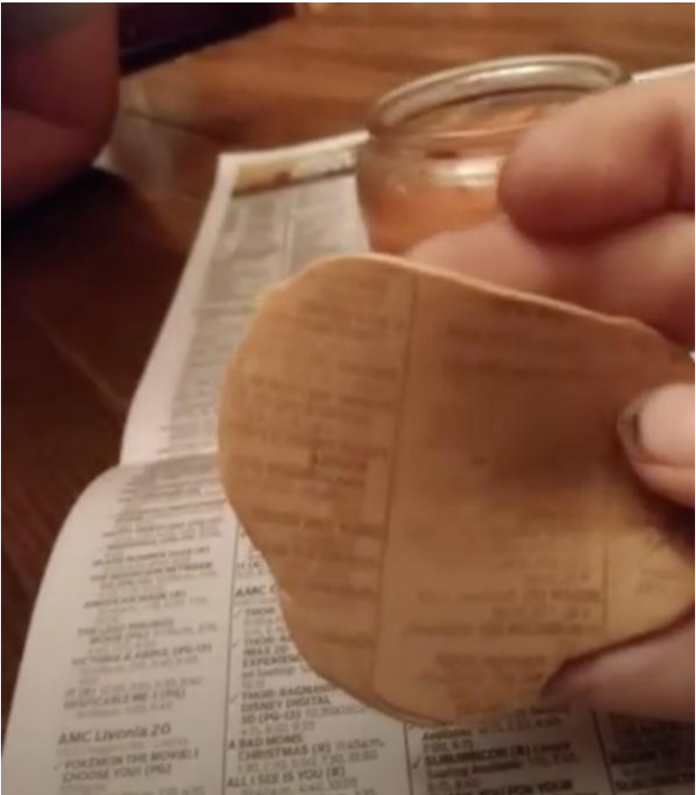
If you've ever used putty on a newspaper...