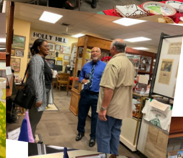
Right: Prize winners show their prizes.