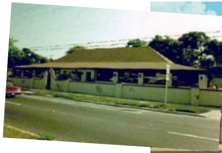
COLONIAL MOTEL 208 Ridgewood Ave. Holly Hill, Florida Tel. CL 2-6995