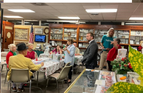
Left: Prize table.